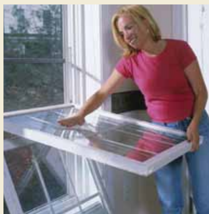
Tilt-in top and bottom sash for easy cleaning.