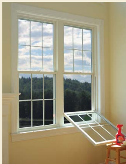
Tilt-in top and bottom sash for easy cleaning.